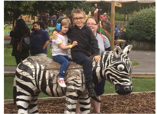
Knowsley Safari Park 29 th August