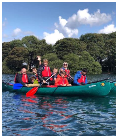
Archery & Canoeing 20 th July